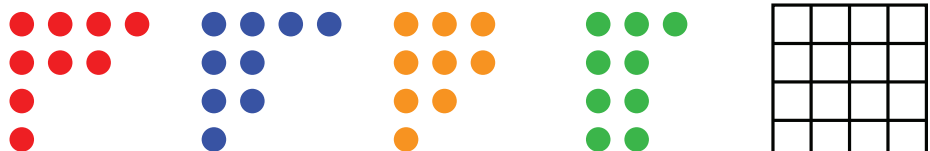
Figure 2. Ferrers diagrams for the partitions 4311, 4221, 3321, and 3222 (left to right) fit into a 4-by-4 box.

these cases, horizontal sequences are much more likely than vertical sequences. When it happens on the 13th draw (about 6 percent of the time) the sequences have almost the same probability, and