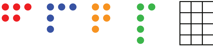
Figure 3. Partitions of 5 into nonnegative values less than or equal to 3 fit into a 4-by-3 box.