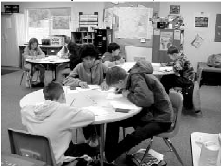
The Gardner School, Vancouver, Washington

This is a great contest and the format is excellent.