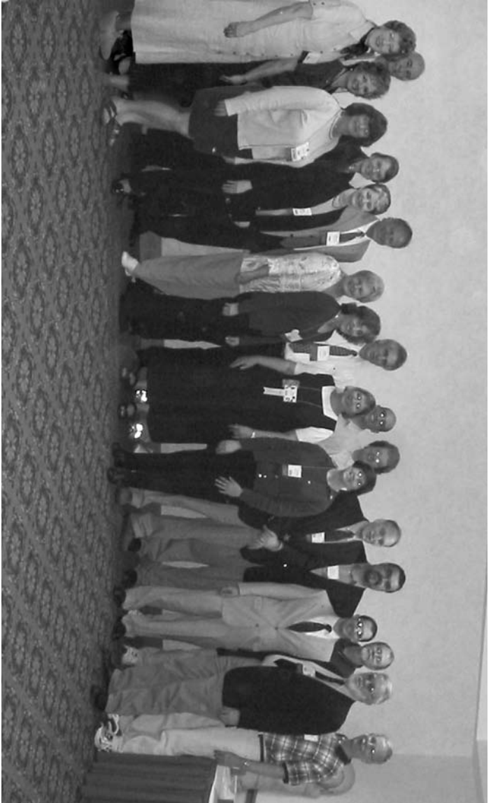
Sliffe Winners Attending Reception

On April 12, 2003 a reception was held at the NCTM (National Council of Teachers of Mathematics) Spring Meetings, in San Antonio, Texas, for current and past recipients of the the Edyth May Sliffe Award for Distinguished Mathematics Teaching.