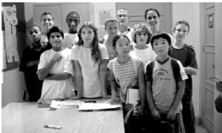
The International School of Havana, Havana, Cuba

Participating students and teachers from the International School of Havana.