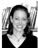
Saint Ann's School Brooklyn, NY