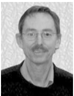
Baylor School Chattanooga, TN