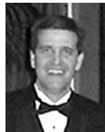
Lynn Greenhill Memorial Middle School