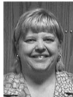
Westside Middle School Omaha, NE