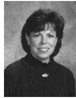
East Middle School Plymouth, MI Carolyn Taggart Smith Middle School