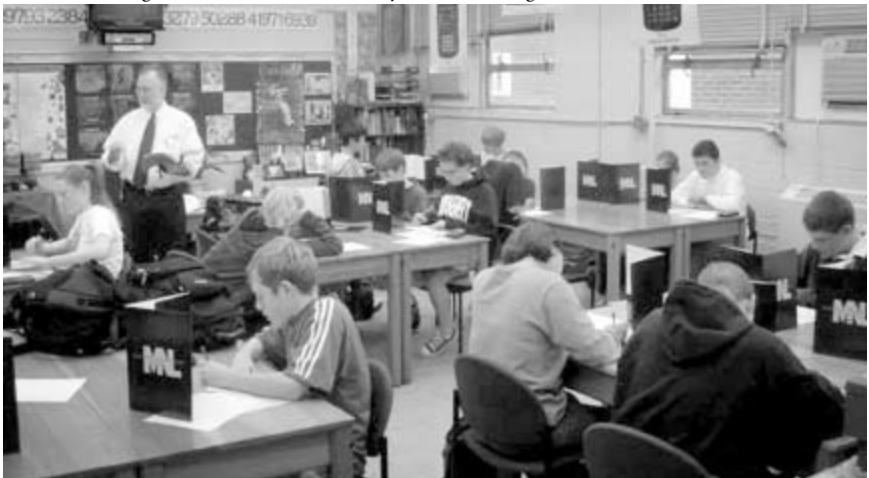
The Central Academy of Des Moines Public Schools, Des Moines, Iowa.