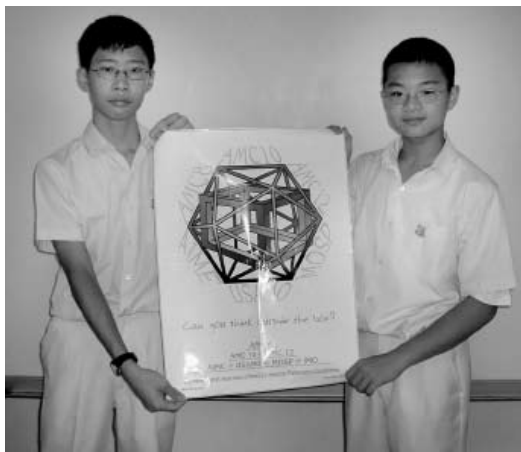
2 Students from the Swiss Cottage Secondary School, Singapore.